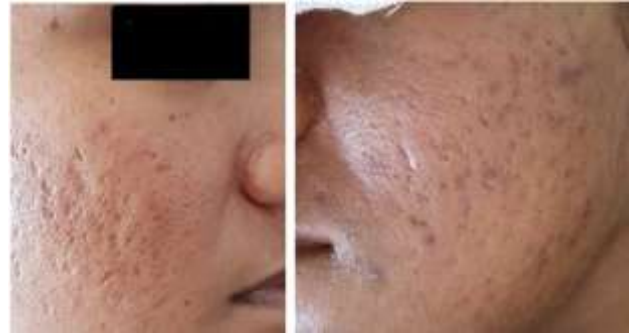
Figure 1: Grade 4 acne scar (before treatment).

In patients with grade 4 scars, 8 patients (57.1%) graded their response to treatment as very good with 50-74% in their acne scars and 6 (42.9%) patients had good improvement in their acne scars with 25-49% improvement. In patients with grade 3 scars, 6 (60%) patients graded their response as excellent with 75-100% improvement in their scars and 4 patients (40%) reported the response as very good with improvement between 50-74%. All 5 patients (100%) patients with grade 2 scars graded their response to treatment as excellent with improvement between 75-100%. Poor response with 0-24% improvement was reported by none of the patients. There is a significant improvement in scar grading in all patients who underwent treatment.