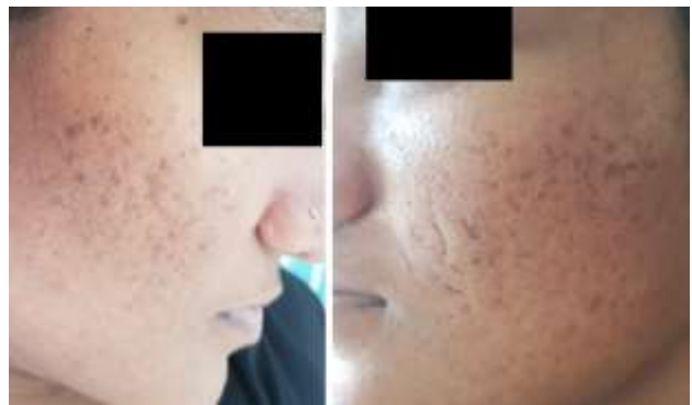
Figure 2: Acne scars (after treatment).