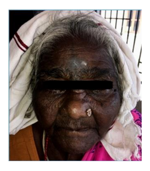
Figure 4: Patient with ACD patch tested positive to nickel from kumkum container.

One female who presented with dermatitis in the face in our study was suspected with Kumkum allergy by its site of occurrence - the glabella which was validated by Babu et al.<sup>31</sup> But this patient turned out to be positive for nickel and could be stated that the ACD developed was actually due to nickel that was a constituent of the Kumkum container (Figure 4).