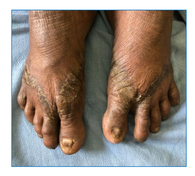
Figure 3: A patient with ACD foot tested positive for black rubber mix.

presented in the hands following foot closely in those patch tested. This could be also due to the frequent handling of chemicals in workplaces and substances of daily use at homes. Allergic contact dermatitis can also occur due to nickel which is implicated as the common cause of hand eczema.<sup>21</sup>